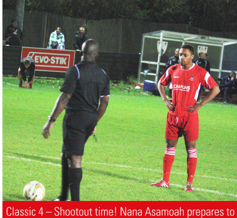
takes his penalty