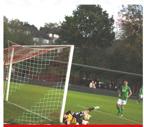
Classic 2 – Guernsey keeper Chris Tardif saves at the foot of the post